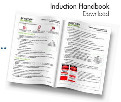
Induction Handbook Download