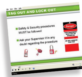
Induction Presentation View online (audio/visual)