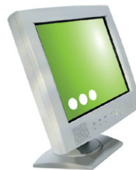
Site Specific Instructions Customer or Company